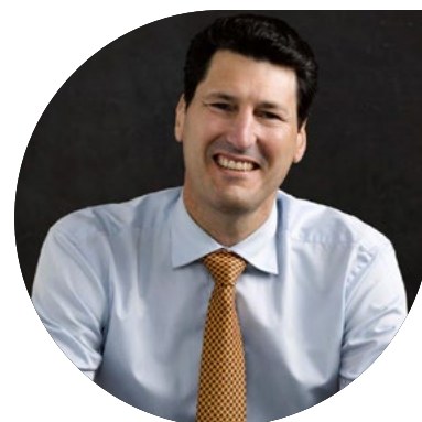
John Eales Eales Endowment

Recommend gifts from your giving fund to one or more of thousands of eligible charities.